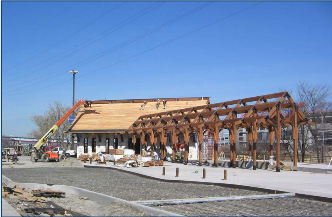
January 26, 2006 – Roofing Installation at Riverfront Station