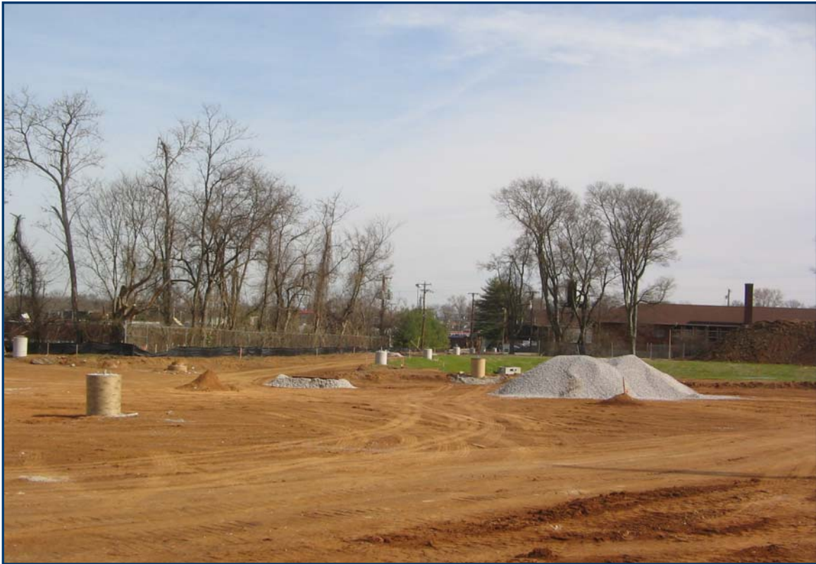
January 31, 2006 – View of Grading and Light Foundations at Donelson