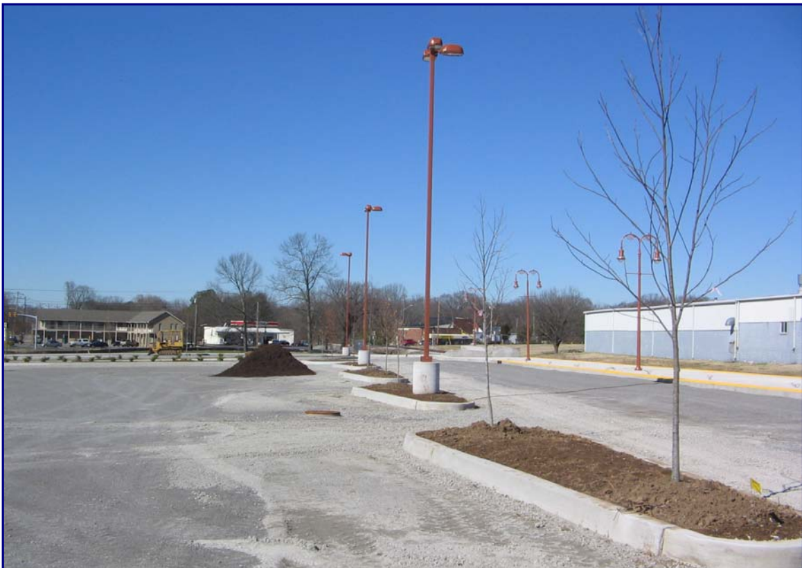
January 26, 2006 – Mt. Juliet Station with Landscaping and Lights